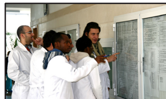
Foreign students secretary

The Faculty of Medicine of Constanța introduced, among the first in Romania, the system of transferable credits (ECTS), thus facilitating the mobility of students from one university to another.